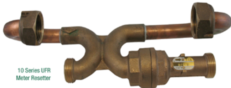
10 Series UFR Meter Resetter