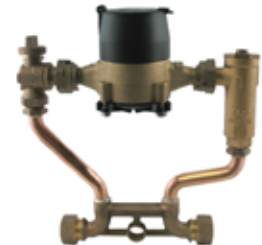
Meter Setter with UFR Angle, Dual-Check Valve