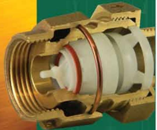
UFR Meter Coupling with Single Check and Non-Check Versions

UFR: The Solution for Slow Steady Revenue Leaks in Your Water System.