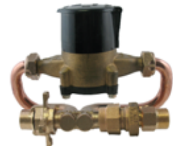
10 Series UFR Meter Resetter